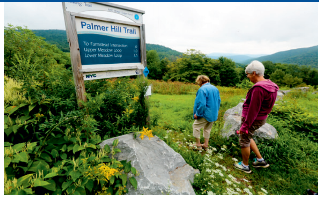
Hikers set out for a beautiful summer trek on the Palmer Hill Trail in Delaware County, one of 11 marked hiking trails that now traverse watershed lands.

ur employees at the New York City Department of Environmental Protection (DEP) are proud to be the stewards of the largest municipal drinking water system in the United States, along with vast forests, streams, meadows and mountains that surround our reservoirs.