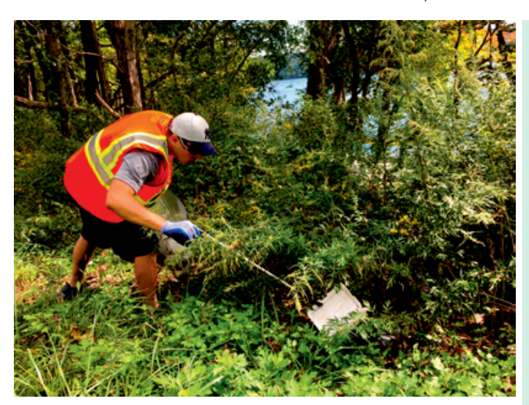
A volunteer at New Croton Reservoir plucks a takeoutfood container from the woods near a popular boat launch area. About 400 volunteers participated in the annual cleanup last year.

Finally, we are always asking outdoor enthusiasts to report dangerous or suspicious activities, water quality threats, or fish kills on City reservoirs and lands. You can do this 24 hours a day by calling 1-888-H2O-SHED (426-7433).